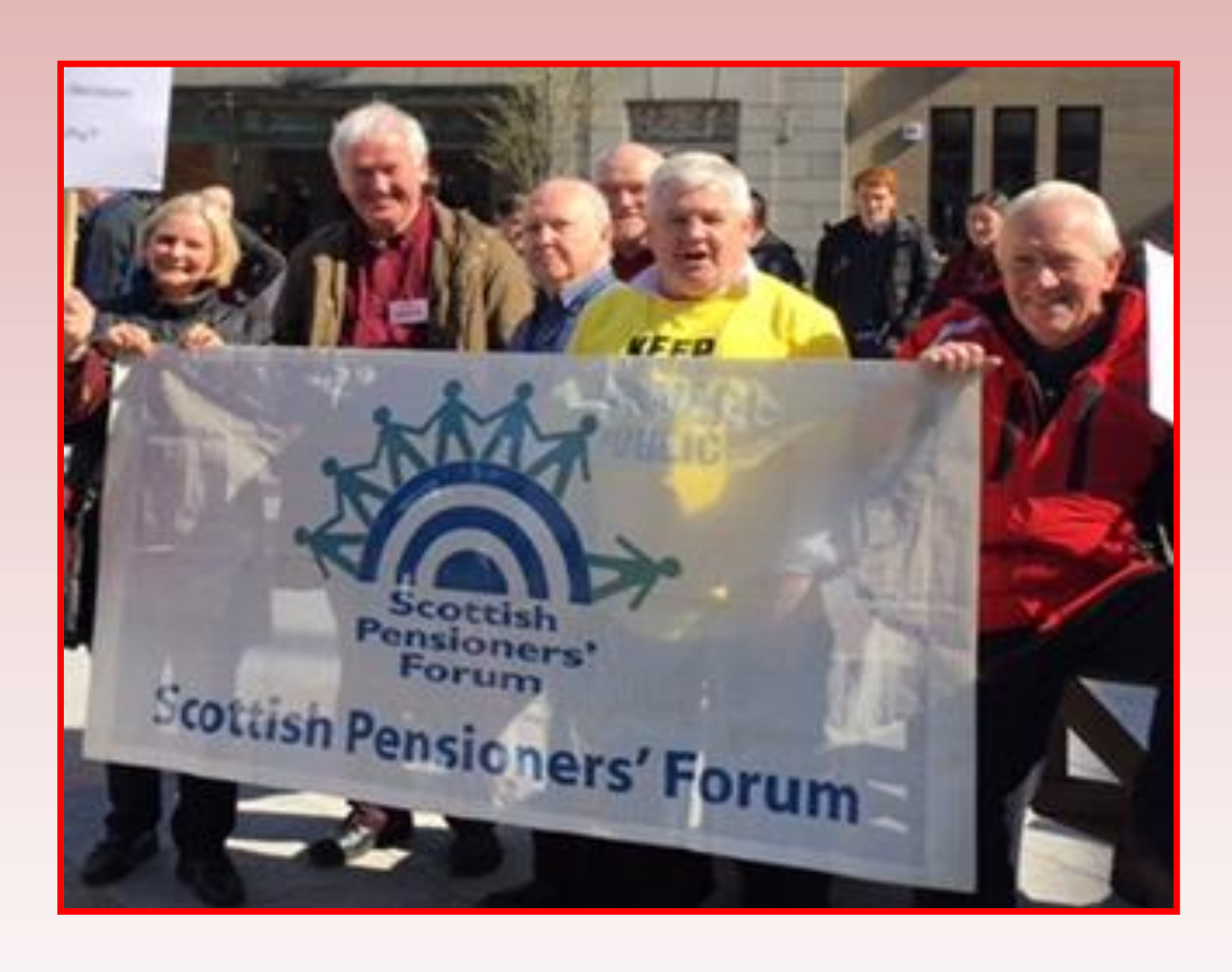
Campaigning For A Better Deal for Older People Since 1992